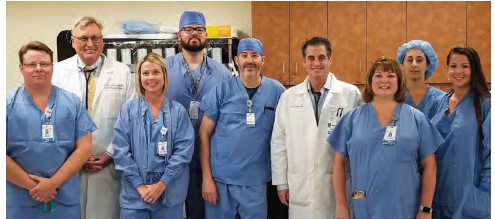
Our team of experts at MelroseWakefield Cardiovascular Center provides the latest advancement in cardiac care, the Impella heart pump, for the treatment of heart failure.

In the last year, two patients have benefited from our team's use of this emergency, lifesaving device.