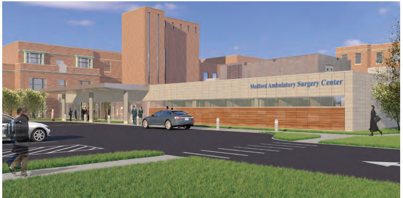
A state-of-the-art surgery center is planned at the Lawrence Memorial Hospital campus to bring more of the services patients need locally.

The development of the ambulatory surgery center is also key to the overall transformation of the Lawrence Memorial Hospital campus that will have a greater