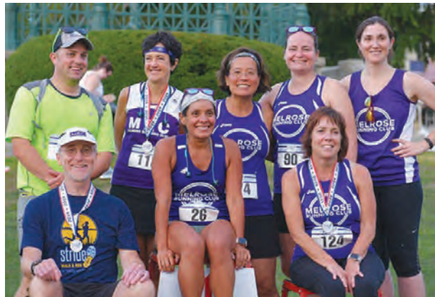
The Stride for Healthy Communities 5K is a family friendly event in partnership with the Melrose Running Club. Proceeds benefit family health services such as community CPR training, nutritional support and other initiatives to keep our communities healthy.